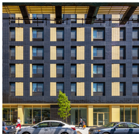
1490 Southern Boulevard