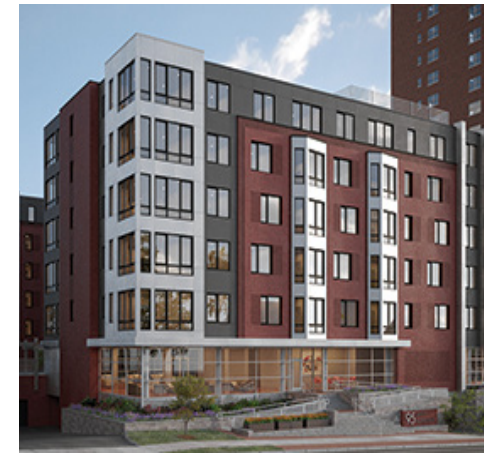
Horizons Watermark (Building America)