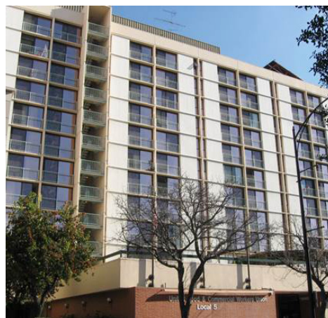
Casa del Pueblo Apartments—San Jose