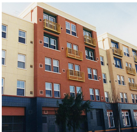
Bernal Gateway—San Francisco