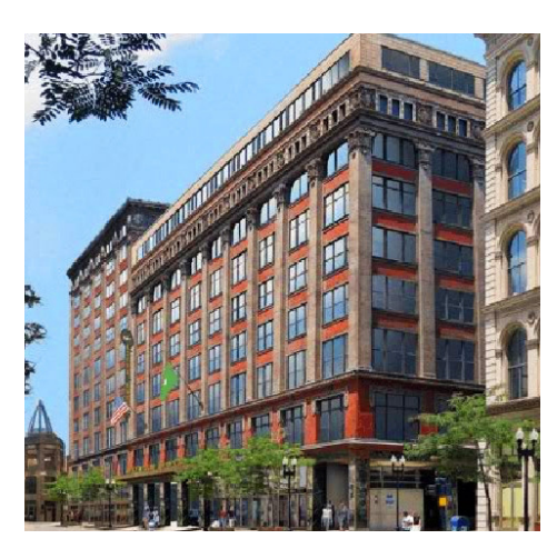
The Laurel-St. Louis

"We appreciate the HIT's ongoing support of union construction for multifamily and senior housing projects in the St. Louis metro area and recognize the benefits provided to the workers and the community."