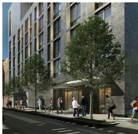
1490 Southern Boulevard