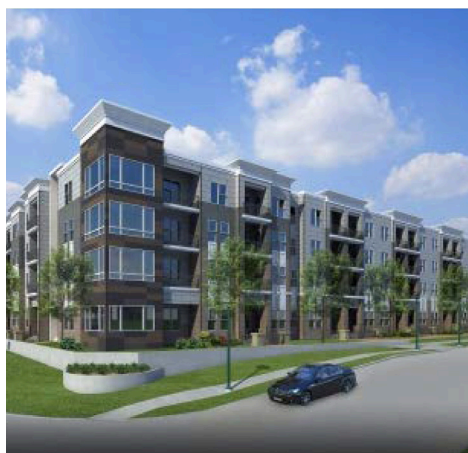
The Heights at Manhasset—Richmond Heights