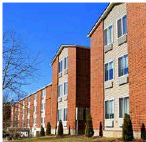
Holy Infant &amp; St. Joseph—Shrewsbury